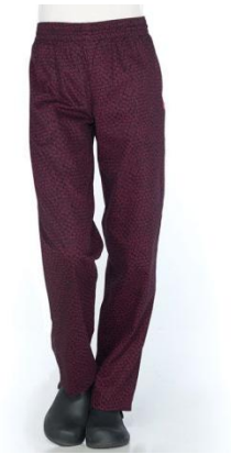
18030- Ladies Pull-On Drawstring Elastic Pant $23.00 XS-XL $26 2X-5X