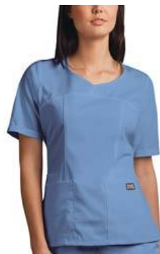
4746- Female V-Neck $17.00 XXS-XL $19 2X-5X