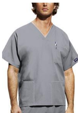
4876- Unisex V-Neck 3 Pocket Top $18.00 XS-XL $21 2X-5X