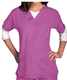
4700- Female V-Neck 2 Pocket Top $15.00 XXS-XL $18 2X-5X