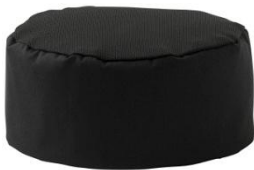
18206- Mesh Top Cook Hat $8.00