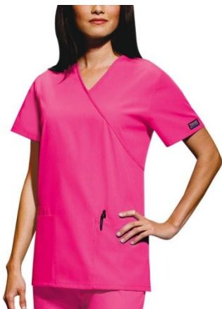
4801-Female Mock Wrap Tunic $17.00 XS-XL $19 2X-5X