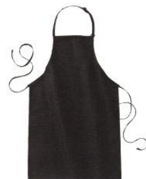
18024- Long Bistro Apron $11.00