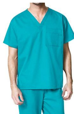
4777- Unisex V-Neck 1 Pocket Top $13.00 XS-XL $16 2X-5X