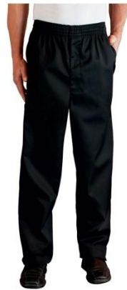
18101- Men's Zipper Front Pant $23.00 XS-XL $26 2X-5X