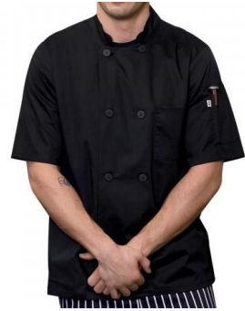
18516- Unisex Short Sleeve Stretch Executive Chef Coat $25.00 XS-XL $28 2X-5X