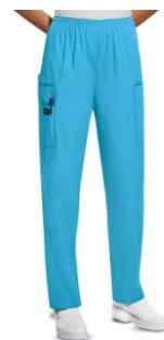
4200- Women's Pull-On Cargo Pant $16.00 XS-XL $19 2X-5X