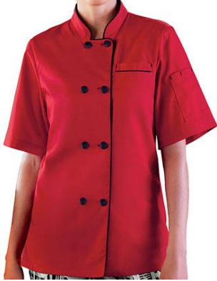
18028- Ladies Short Sleeve Executive Coat $24.00 XS-XL $27 2X-5X