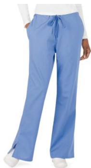
4101-Women's Drawstring Flare Leg $17.00 XXS-XL $20 2X-3X