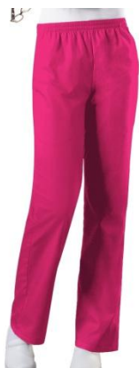
4001- Women's Pull-On Pant $15.00 XS-XL $18 2X-5X