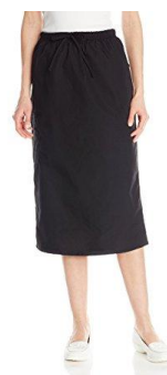
4509- Women's Drawstring Skirt $15.00 XS-XL $18 2X-5X