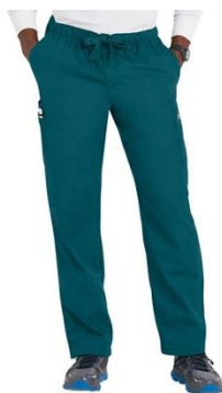
4000- Men's Drawstring Cargo Pant $21.00 XS-XL $23 2X-5X